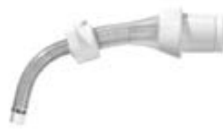
REF 371 without H 2 O Cuff, proximal longer