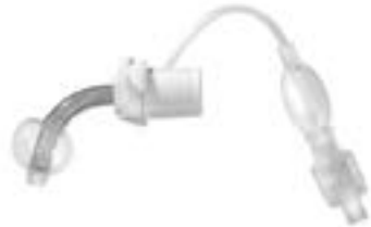
REF 372 with H 2 O Cuff