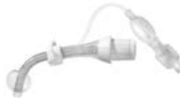
REF 373 with H 2 O Cuff, proximal longer

Standard tubes and length variants (C-Variants) for REF 370 / REF 371 / REF 372 / REF 373