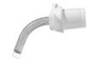
REF 370 without H 2 O Cuff